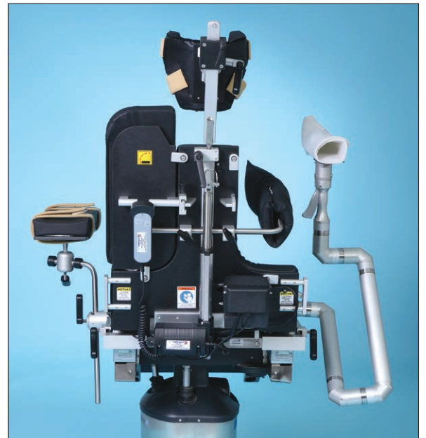
Images shown with Powered Beach Chair