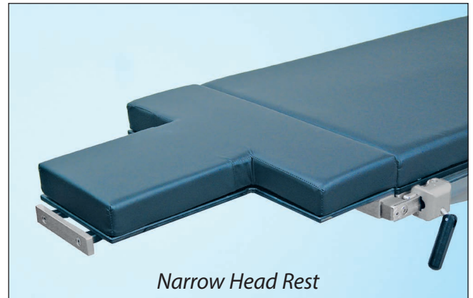
Narrow Head Rest

#508-0109 Narrow Head Rest Replacement Pad